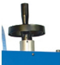
Possibility to print objects with maximum heights from 150 mm