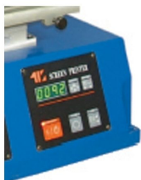
LCD display with several functions