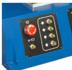
Print speed and stroke , flood speed and stroke with individual adjustments