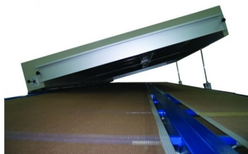
Possibility to equiped dryer with 2 belt systems