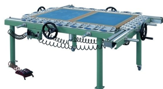
Hybrid screen mesh stretcher available