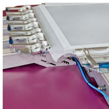
Possibility to adjust for several screens heights with toolless operation