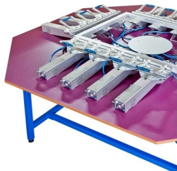
Table with special design available