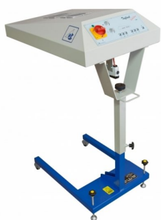
Other shapes of flash cure available