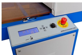
Opção equipar tunel com painel electrónico com mais de 15 opções extras