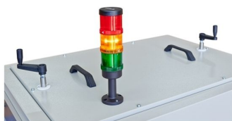
Possibilidade de ajuste de altura das resistências ao tapete