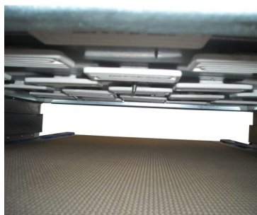
Distribuição perfeita das resistências sobre a largura do tapete