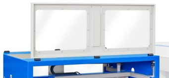
Equipped with security covers and security switches