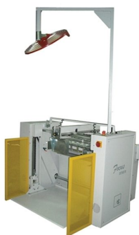
Stackers to be equipped in high productivity machines available