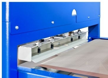
Gripping clamp equipped with 4 pressure cylinders with position adjustment