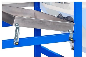
Reception table with inclination and height adjustment possibility