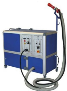
Manual flocking generators for suitable for 3D available