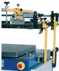
Screen printing frame allways in horizontal position