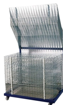
Drying rack in any size desired available