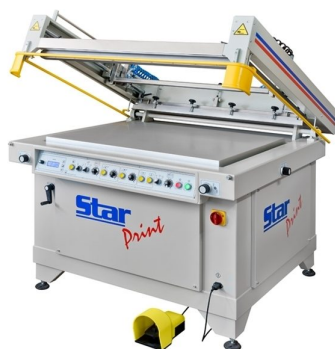
Semi automatic printing units also available