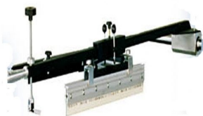
One guide hand arm with pressure control from squeegee and flood bar