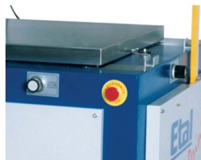
Micrometrics registers on the printing plate