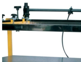
Possibility to print until 100 mm height and also Automatic vacuum start/stop