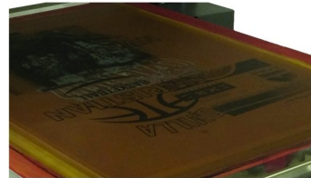
UV black ink with 3,5 density