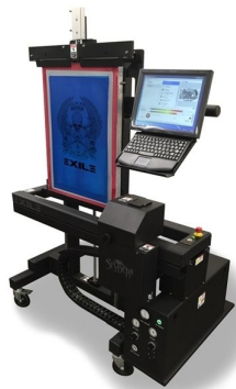
Other CTS system for high speed and performance available