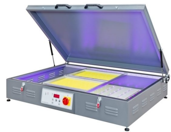
UV LED CTS special design available