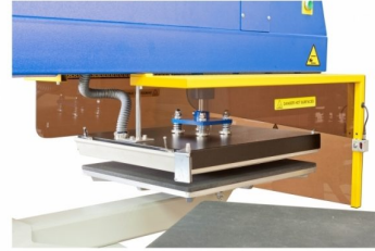
Security photocell for operator safety