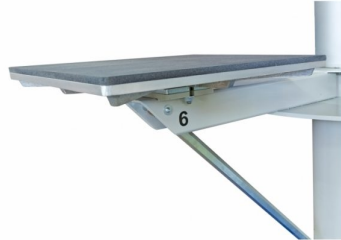
Option to change the size of the plates or special fitting without the support arm