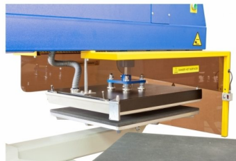
Security photocell for operator safety