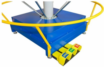
Servo Motor equipped with functions to move: Front, Back and Half Index