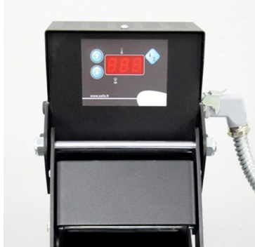
Temperature and timer digital controlled