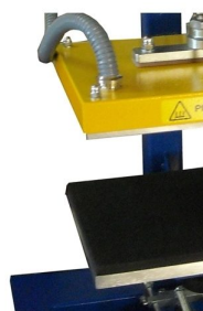
125 mm pressing cylinder course so yiu can transfe rin high profile pieces