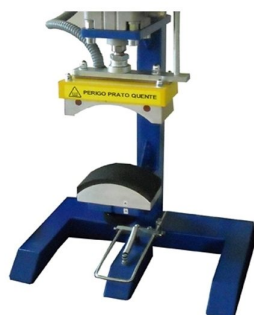
Possibility to have full caps accessory