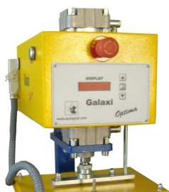
DISPLAY LCD with several languages available