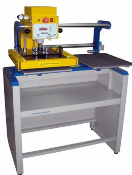
Other models with bigger transfer plates available