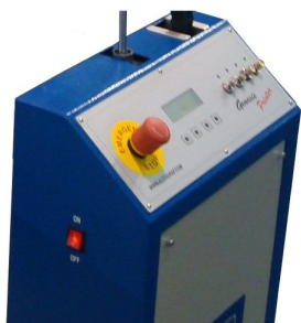
LCD display in several languages and with the possibility to use several printing programs to use various ink types (water based,