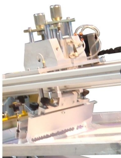
Independent regulation from squeegee and flood bar pressure