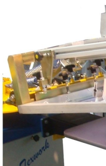
Easy installation and removal from printing head (no need for any special tools to install or remove the printing head)