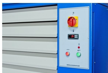
Digital temperature controller with display