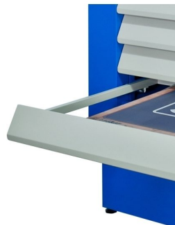
Drawers smoothly running in ball-bearing slides with end stop