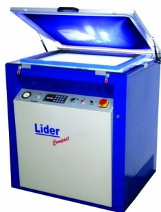
Exposing units in several models available