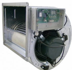
High income hot air ventilator