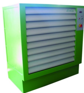
Horizontal drying cabinets available