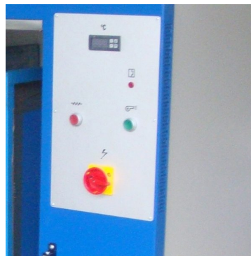
Digital temperature controller with display