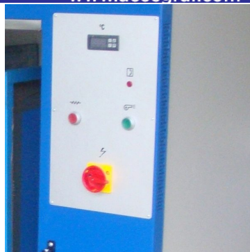
Digital temperature controller with display