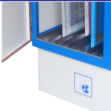
Screen slots made in metal treated with capacity to accepted several screen sizes