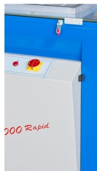
Instant ON/OFF from halogen lamp