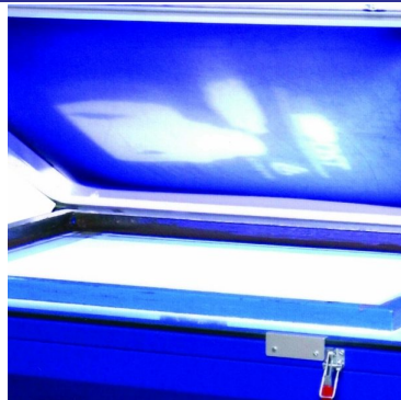
Halogen light source