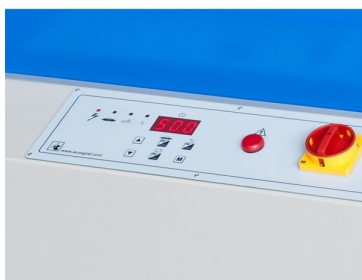
Digital programmer from exposing times with photo cell