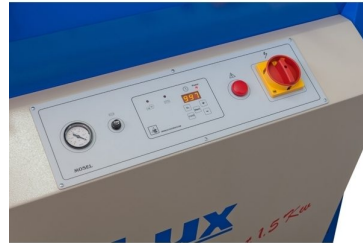
Control panel with vacuum pressure indicator; LCD display with memory saving