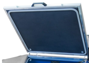
Special vacuum rubber to have perfect contact between offset plates and film