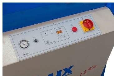
Control panel with vacuum pressure indicator; LCD display with memory saving