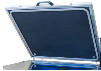
Special vacuum rubber to have perfect contact between offset plates and film