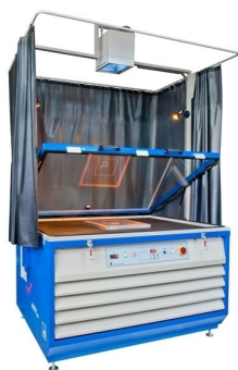
Exposure units equipped with halogen light source available