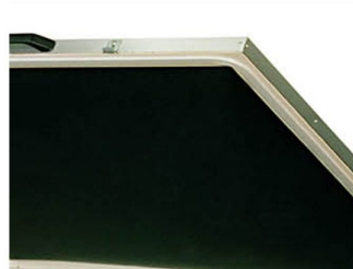
Perfect contact between screen and vacuum rubber due special rubber