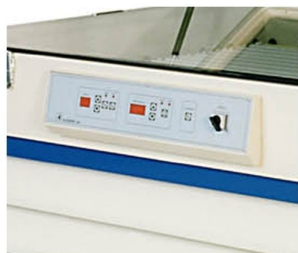
LCD control panel with fully automatic operation for vacuum and exposure