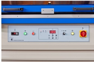
LCD control panel equipped with photocell from light intensity measure to make automatic compensation from