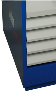
Drying cabinet with forced ventilation and working temperature from 15 to 50 degrees