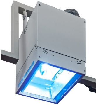
Halogen light source for fast and perfect screen exposure