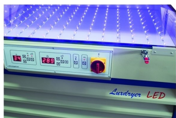
UV Special LEDs for fast and accurate screen exposure