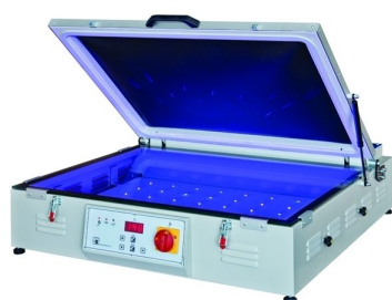
Simple and more economic exposure units available