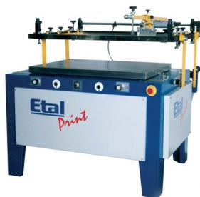
Other models with parallel opening and table top available