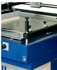
Possibility to print in flat material with height up to 100 mm