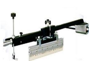
One guide hand arm with pressure control from squeegee and flood bar