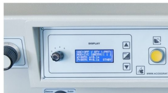
LCD display with several informations such us: speed, timers, working mode, etc..