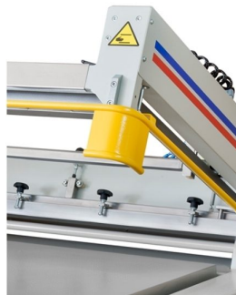
Emergency security bar with automatic reverse from descending to ensure operators safety in all machine area