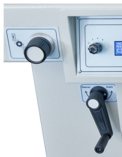
Printing table can be adjust in height up to 20 mm by using a handle