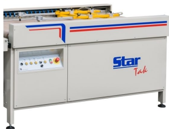
System with suction grippers or clamps to hold and to release the leaf