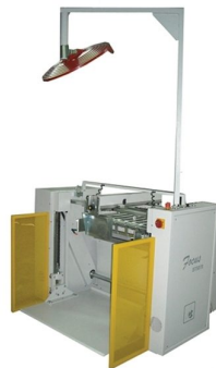
Several types from automatic sheets stackers are available