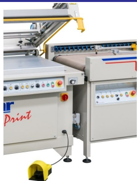
Lateral ou back side removal from sheet is possible to built