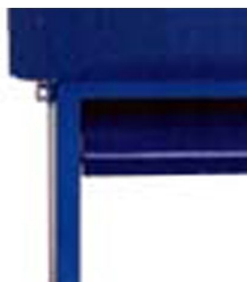
Equipued with 1 drawer to save support maetrial