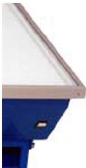
Equipued with glass and under light in top part