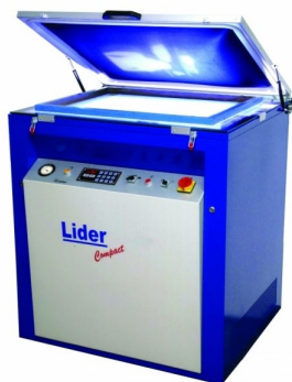
Offset exposing plate machines available