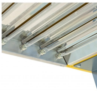
Special lamps holders for easy removal of lamp