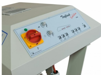
Individual ON/OFF switch with facility to adjust power from output lamp