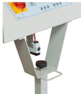
Option to have photocell for automatic start or machine communication