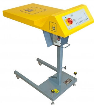
Other shapes of flash cure available