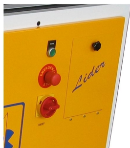
5 different programs to fold several textiles types