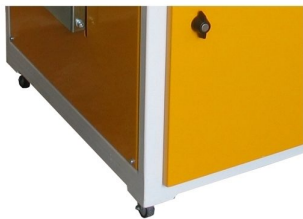
Equipped with wheels to easy displacement