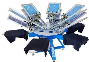
All types from textile screen printing machines available