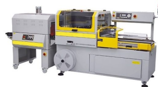
Can be equipped with automatic packing device