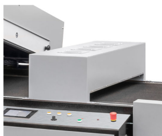
3xIR lamp box with power adjustment between 20% to 100%