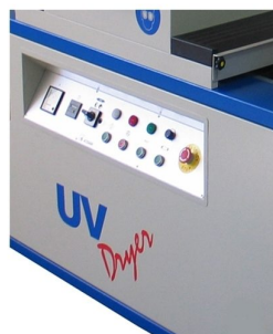
Option to have electronic lamp power adjustment from lamp to achieved optimal results