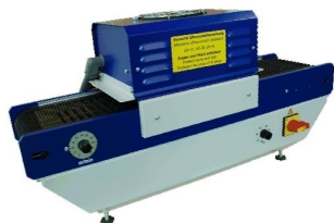
Laboratory systems available