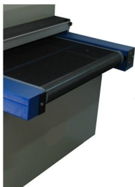
Belt made in Teflon mesh anti-static