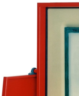
Possibility to make inversion from screen to vertical or horizontal position