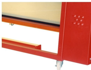
Equipped with wheels to make deployment from the machine easy and comfortable and also equipped with yellow light to prepare the job