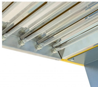
Special lamps holders for easy removal of lamp