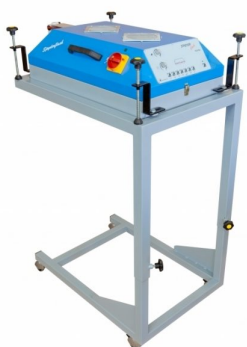
Other shapes of flash cure available