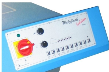
Individual lamp ON/OFF switch with facility to adjust lamp power output (20% to 100%)