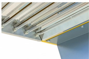
Special lamps holders for easy removal of lamp