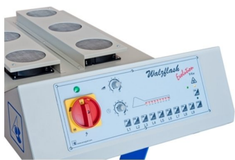
Individual ON/OFF switch with facility to adjust power from output lamp