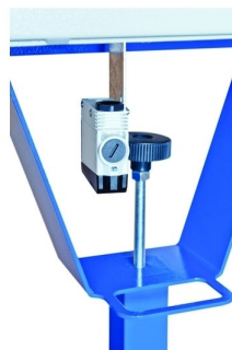
Option to have photocell for automatic start or machine communication