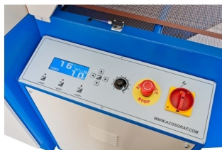
Opção de painel electrónico com opção de economia de energia