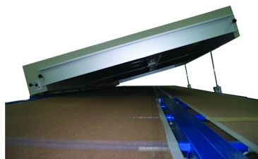
Opção de abertura lateral feita através de cilindros disponíveis