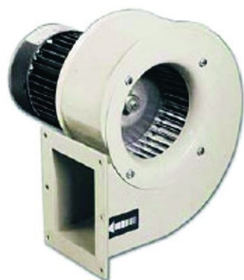
Turbina de re circulação de ar quente de alto rendimento dando a possibilidade de secar tintas base de água e outras