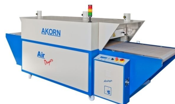
Tuneis para secagem de impressão feita através de DTG disponíveis