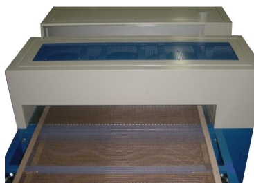
Pontes de ar frio para arrefecer peça disponíveis