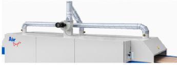
Smoke extraction system that includes a chimney at the entry and exit with suction motor