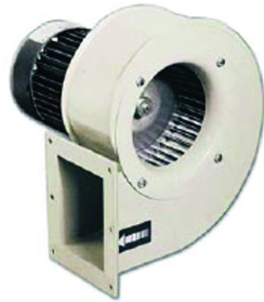
Hot air turbine with re circulation from air in closed circuit for option water base drying