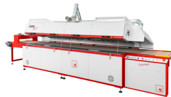
Angular opening from dryer option available