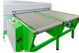
Double belt "SIDE BY SIDE" systems available