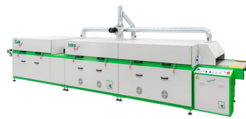
Several dryer configurations available like - Cooling modules; different heat lengths; etc...