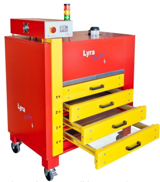
Other dryers for DTG available - Example : Drawers systems