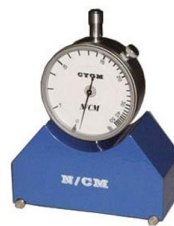
Tensiometers to check mesh tension available