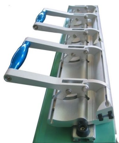
Clamps made in high resistance aluminum to hold mesh in high tension