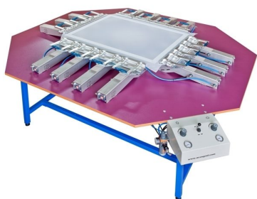
Mesh stretcher with pneumatic clamps available