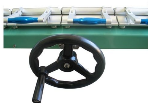
Adjusting from mesh tension made with smoothness and accurate values