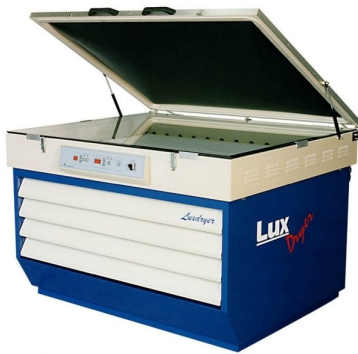
Other exposing unit models equipped with drying cabinets available