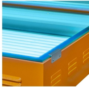
Equipped with UV light bulbs special designed for screen printing screens