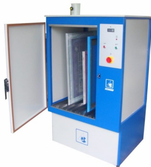
Drying cabinets vertical and horizontal available