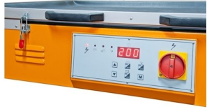
LCD display with electronic timer full automatic