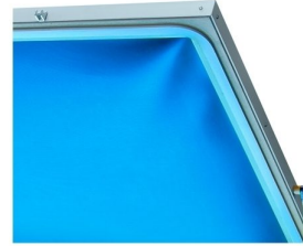
Perfect contact between screen and vacuum rubber due special rubber