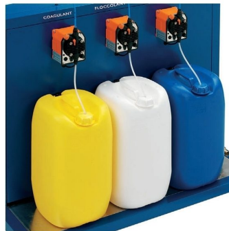
Color chemicals encoding for easy identification