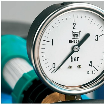
Equipped with a pressure gauge and emergency stop button