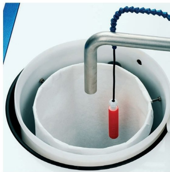
Wastewater system has been designed to operate fully automatic