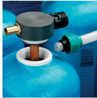
Fast union connectors and taps in order to make easy