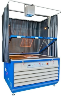
Several models from exposing units available