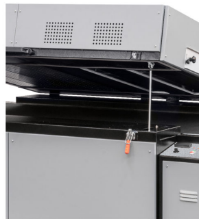
Equipped with 2x high performance UV lamps