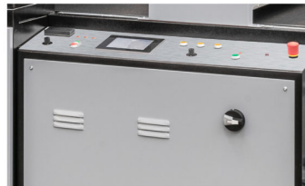
Control panel with 7 inches touch screen