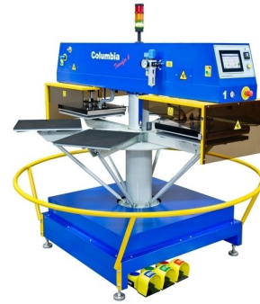
Full automatic carousel heattransfer machine available