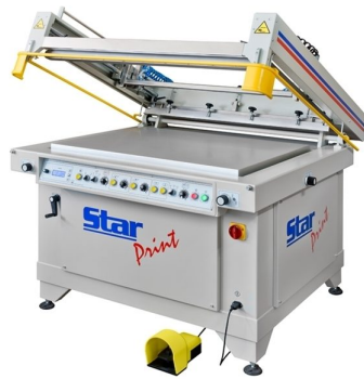
1/2 and 3/4 automatic screenprinting machines available