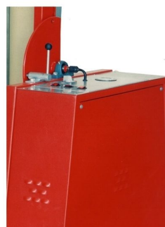
Possibility to the machine with ACOSGRAF electronic board with photocell from light intensity measure to make automatic compensation from