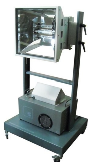
Halogen light source lamps LUX RAPID models available