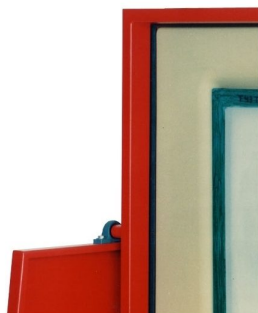
Possibility to make inversion from screen to vertical or horizontal position