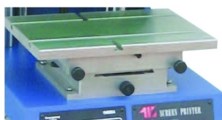
Micro registos de impressão com ajuste na mesa de colocação de peça